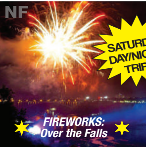
FIREWORKS: Over the Falls