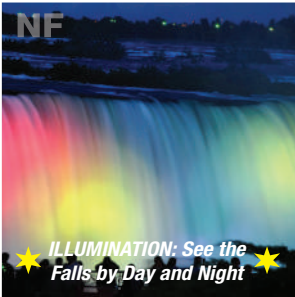
ILLUMINATION: See the Falls by Day and Night